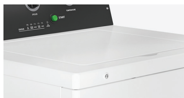
PREMIUM PORCELAIN-ENAMEL TOP & LID