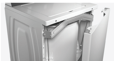
REMOVABLE FRONT PANEL